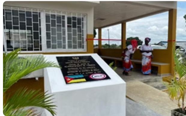
Health Centre Interior