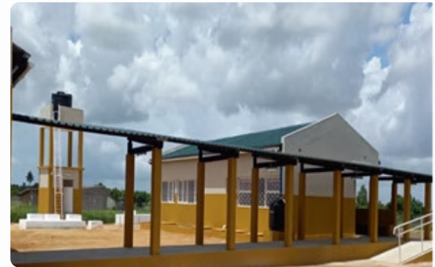
Health Centre Staff