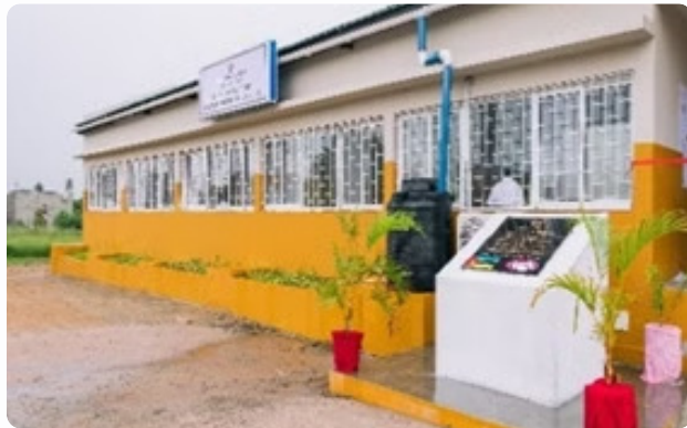
Health Centre Exterior

Community Development: Supporting local communities through Construction of a health centre in Mandruzi-Dondo, fully equipped with modern equipment.